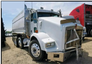
2008 KENWORTH T800 C15 475 SDP, RTO16908LL, DSP41 3.90 on Chalmers Suspension . . . . . $Call