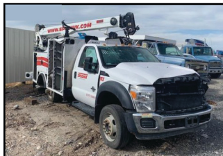
2016 FORD F550 Ford, 6.7 Powerstroke 440 HP 63k Miles, 4X4, Good Builder, Call For More Info, Stk# 91619 . . . . . $14,995