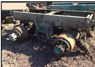
Many Good Used Hendrickson Haulmax Suspension Cutoffs w/ Eatons or Rockwells in Different Ratios Call For Info