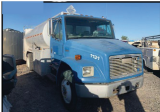
1997 FREIGHTLINER M2 Truck Runs & Drives, 5.9 Cummins, RT9710B Transmis- sion, 20145 Rockwell 4.33 Ratio $12,995