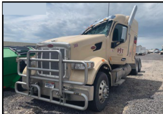
2019 PETERBILT 567 Low Mile Builder! MX13 510HP, RTLO18918B, 40-14X 3.55 Rear Locker, Stk# 70919 . . . . . $Call