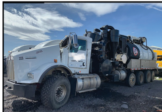
2014 KENWORTH T-800 Vac Truck, ISX 485, RTLO16918b, 20k front, 2 steerable tags D46-170 3.91 on RT460 Hendrickson... $Call