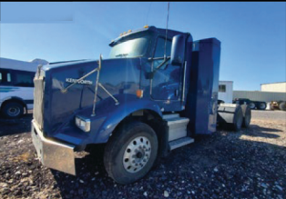
2014 KENWORTH T800 ISX12 CNG Running Core, Allison 4000, DDP41 Double Locker, Stk# 81819 . . . . . $15,000