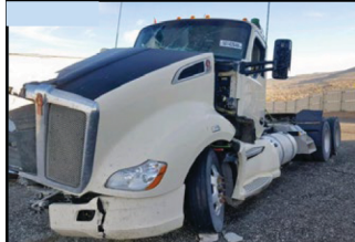
2018 KENWORTH T680 108K MILES, MX13 510 HP, FO18E318E-MXP, DD46-170 3.73 w/ AG460 Suspension . . . . . $Call