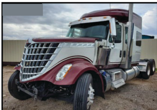
2017 INTERNATIONAL LONESTAR BUILD-ER 249k Miles, ISX15 525 HP (79954365), RTLO18918B, 3.36 Rears . . . . . $29,995