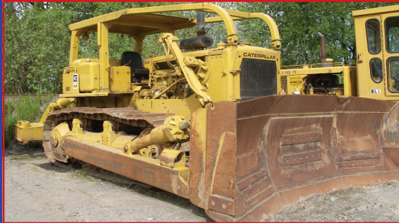
CAT D8K Crawler Dozer w/ 4-BBL Ripper , U-blade & 85% extreme service UC, has never seen the rock! sn 77V18094, 7,080 hrs. showing..... $55,000.