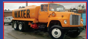
1992 FORD 8000 Water Truck , w/newer 3600-gal. McLellan tank, 78K orig. miles, Cat power, 13-spd. trans., dual fuel tanks & (2) dsl. engines w/front & rear spray, city owned ..... $17,995.

- STOLEN EQUIPMENT REWARD - FOR INFORMATION & RECOVERY OF: (2) 303 CAT Mini Excavators, sn's AFW00407 & AFW01049