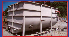
2008 CASE/COTTER Oil Water Separator , 11,355 gal./300 GPM 2-6" inlet ports w/gate valve, corrugated plate separator, 6" tilting & rotating skimmer, 6" effluent..... Call.