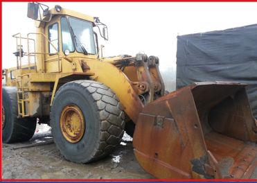
980C , sn 63X09310, All service records available since new ..... $48,500.

P.O. Box 295 • Snohomish, WA 98291 • 425-754-8101