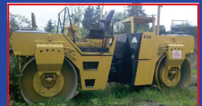
BOMAG BW161AD Roller , sn 10164050-0162, 2,959 hrs. showing ..... $14,995.