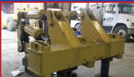
CAT D8K 4-BBL Ripper , sn 93M5654, w/ stack valve, block/hoses, (shanks avail. extra) slight mod to fit D8N unit... $16,995.