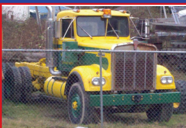
1974 KW Heavy Haul Trucks , 1693 eng., 12513 trans. with retarder, 44K RA, single owner trucks, needs motor work ..... $9,995 or make an offer!