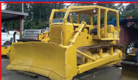
CAT D7F Crawler Dozer , winch, sn 59P-2719 ..... $29,995.