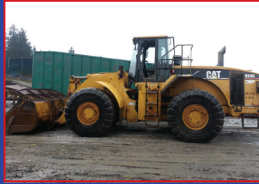
980G , sn 2KR01182..... $35,000.