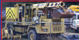
1995 GRADALL G3WD , AWD, VIN 0138-335, good 445/65/22.5 Michelin tires, 7,246 actual hrs., ex-county unit..... $18,995.