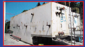
BAKER 21,000-Gal. 37' Tank , (3) settlement cmpt., pup ports, access ladder and walk-board, truck & dolly pins..... Call for Details.