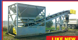
Sand Bag Machine , complete with everything shown, ex-city unit..... REDUCED $49,995 $39,995.