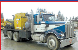
1981 KW Service Truck , 800-gal. fuel tank, waste oil with waste pump, (6) product tanks, call for more details ..... $14,995 $13,995.