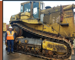
CAT D9L PARTING OUT