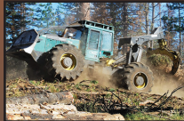
2002 660D TIMBERJACK, 13K HRS. AC/HEAT, DUAL FUNCTION ARCH GOOD 30.5X32 TIRES...$39,000. ALSO: TIMBERJACK 2000 660 DUAL FUNCTION ARCH AC/HEAT...$29,000.