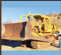
D8K WITH 4BBL RIPPER PARTING OUT