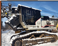
2011 LINK-BELT 240X2 DENHARCO DM4550 10K HRS, ONE OWNER $155,000.

509-469-9420 • 509-952-9223 • DUKESCABIN@HOTMAIL.COM