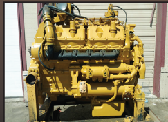
CAT ENGINES: 3304PC, 3306D1, 3056, D342, C4.2, 3208, 3408, 3116 mechanical