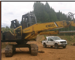
KOBELCO SK300 MARK IV PARTING OUT