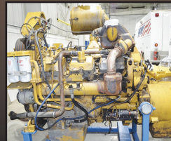
CAT ENGINE D10R, 3412E