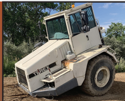
TEREX TA30 PARTING OUT GOOD ENGINE AND TRANS.