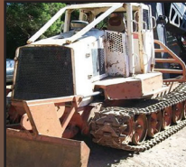
FMC 210 PARTING OUT