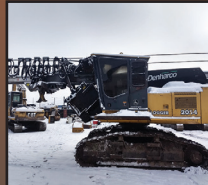
DEERE 2054 with DM4400 Limber PARTING OUT