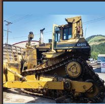
D9N PARTING OUT