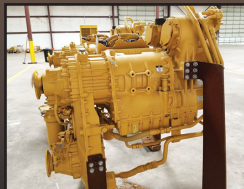
REBUILT CAT TRANSMISSIONS: 930G, 938F, 924G, 525, D9L, 988B