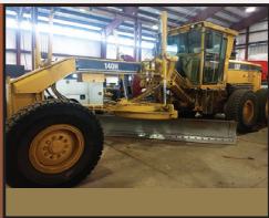
2006 CAT 140H VHP 8,700 HRS. SNOW WING, MICHELIN TIRES .....$98,000.