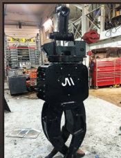
JEWELL GRAPPLES 60" AND 65"