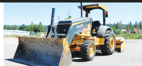
2011 DEERE 210LJ SKIP LOADER W/ ONLY 2500HRS! HAS A GP BKT, GANNON SCRAPER BOX W/ 3 POINT HITCH & RIPPERS, 4X4, FRONT TIRES 50%-75%, REAR TIRES 60%, & A TIER 3 DEERE ENGINE. READY TO WORK. 4 OF THESE SKIP LOADERS AVAILABLE..$35,900