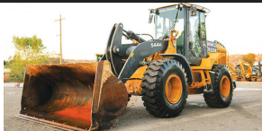
2010 DEERE 544K WHEEL LOADER, 4000HRS! HEAT/AC, QUICK COUPLER, 3YD GP BKT, PINS & BUSHINGS ARE TIGHT, TIER 3 DEERE ENG, PROFESSIONALLY MAINTAINED ITS ENTIRE LIFE....$85,900