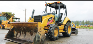
2007 CAT 414E SKIP LOADER W/ ONLY 2000HRS! EQUIPPED W/ AN MP BKT, GANNON BOX W/ RIPPERS, 4X4, TIER 2 ENGINE, & RIDE CONTROL. ALL MAINTENANCE HISTORY SINCE NEW.....$35,900