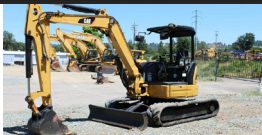
2008 CAT 305C CR MINI EXCAVATOR, 1400 HRS!!! DROPS, SWING BOOM, TIER 2 ENG, AUX HYDRAULICS, NEW RUBBER TRACKS, & BACKFILL BLADE, JUST PERFORMED 500 HRS SERVICE.....$37,500