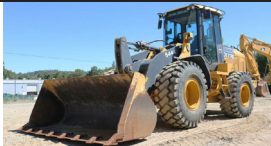
2010 DEERE 544K WHEEL LOADER, 3600HRS! EROPS, HEAT/AC, DEERE QUICK COUPLER, TIER 3 DEERE ENG 3 YD BKT W/TEETH. VERY TIGHT UNIT, NO ISSUES READY TO GO TO WORK!...$85,900