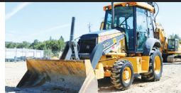
2010 DEERE 310J BACKHOE W/ ONLY 1000 HRS!! EQUIPED W/ EROPS HEAT/AC, TIER 3 DEERE ENGINE, E-STICK, 4X4, AUX HYD, WR COUPLER, AND GP BUCKET. EXTREMELY CLEAN AND TIGHT. NEW FRONT TIRES REARS ARE AT 75%. COMES W/3 BUCKETS...$56,900