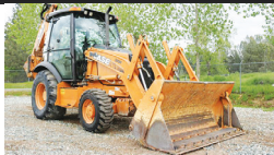
2011 CASE 580N LOADER BACKHOE W/ ONLY 2500HRS. HAS 4X4, EROPS W/ HEAT/AC, MP BUCKET, E-STICK, AUX HYDRAULICS, PILOT CONTROLS, & A TIER 3 ENGINE. 4 UNITS AVAILABLE.....$52,900