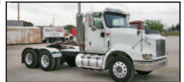
2003 INTL 9400L "Day Cab," Cummins ISM 330, 10-spd., AC, PS, Jakes, cruise, 187" WB, air leaf, A/S 5th, alum. Budds, stainless fenders, low miles.