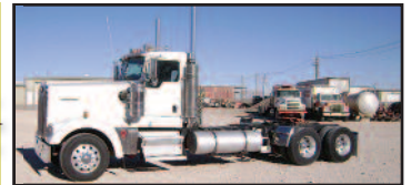
2004 KW W900L "Daycab," Cat C15 435 hp., 10-spd., 3.55 ratio, cruise, Jakes, cold AC, 12K/40K axles, 8-bag air ride, A/S 5th wheel, dual 120-gal. tanks, Budds & more.

Buying - Selling Dealing - Call Now! 800-725-8785