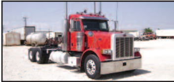
2006 PETE 379 "Daycab," Cummins ISX 500 hp., 13-spd., 3.70's, Ultracab, 12K/40K axles, cruise, Jakes, 250" WB, air leaf, dual stacks/breathers, low miles, call today!