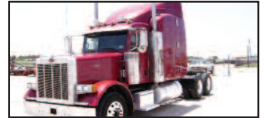
2006 PETE 379 "Ultracab," Cummins 500 hp., 13-spd., 63" Uni-bilt double bed, Jakes, cruise, very clean, dual stacks/breathers, 3.70 ratio, air slide 5th wheel, 420K, more...