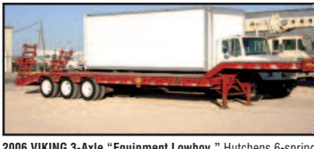
2006 VIKING 3-Axle "Equipment Lowboy," Hutchens 6-spring suspension, 22.5 rubber, Budd wheels, 46' overall length, 28.5' lower deck plus 9' neck & dovetail, 6' spring loaded ramps, 102' wide, awesome trailer.

Buying - Selling Dealing - Call Now! 800-725-8785