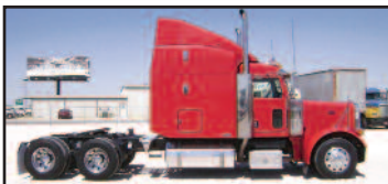
2006 PETE 379 "Ultracab," Cummins 500 hp., 13-spd., 63" Uni-bilt double bed, Jakes, cruise, very clean, dual stacks/breathers, 3.70 ratio, air slide 5th wheel, 413K, clean...