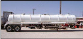
2006 DRAGON 130-Barrel Vacuum Trailer, 42' overall length, 4-spring susp., 11R24.5, steel Budd wheels, good tires and brakes, save big from new...