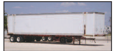
1995 GREAT DANE "Container Trailer," 48', container w/decent floor, sliding spring susp., (3) settings on trailer - 48', 50', 53', 22.5 rubber, Budd wheels, good brakes..... $4,950 or Best Cash Offer.