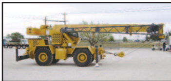
1990 GROVE RT528C "Rough Terrain Crane," Cummins 6BT (5.9L), Clark automatic trans., Rockwell axles (planetary), 20.5x25 rubber, 25' jib, 131" WB, outriggers, more.