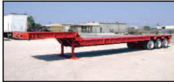
1981 ATOKA 3-Axle "Oilfield Lowboy," 48' overall length trailer, 9' neck, 36' lower deck plus 8-5/8" tail-roller, Neway spring & beam susp., 22.5 lo pros, good tires & brakes, nice.