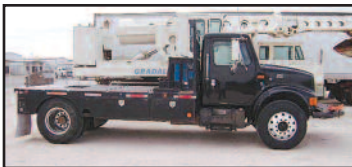
2000 INTL 4700 "Welding Truck," 466E DTA 190 hp., 6-spd., AC, PS, cruise, spring susp., 188" WB, custom bed w/Miller Bobcat 250 welder, good shape, HEAVY - NON-CDL.