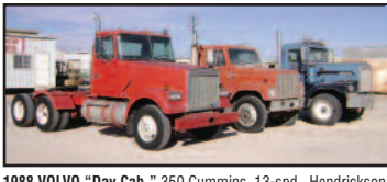
1988 VOLVO "Day Cab," 350 Cummins, 13-spd., Hendrickson; 1979 IHC F2574 "Winch Truck," 350 Cummins, 13-spd., Braden winch; 1997 FRTL FLD-120, 400 Detroit, 9-spd., 12K/40K, "fixer upper" - ALL UNDER $5,000.