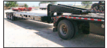
1978 VIMCO 3-Axle "Oilfield Lowboy," 10' narrow neck, 36' lower deck plus big 8-1/2" tail-roller, heavy Neway spring & beam susp., 11R17.5 rubber, good tires & brakes, fresh paint.