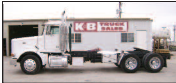
1995 PETE 378 "Heavy Day Cab," Cat 3406C 425 hp., 18-spd., 3.55's, double frame, Jakes, 12K/46K axles, air slide 5th w/ramps, 24.5 rubber, headache rack, good miles, ready.