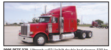
2006 PETE 379, Ultracab w/63 Uni-bilt double bed sleeper, 500 hp. Cummins, 13-spd., 3.70 ratio, cruise, Jakes, cold AC, Pete air leaf, 250" WB, A/S 5th wheel, alum. Budds, dual stacks/breathers, 410K miles, dealing strong.