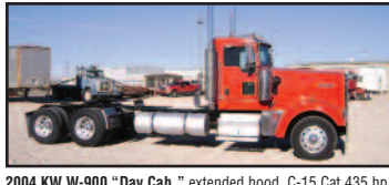
2004 KW W-900 "Day Cab," extended hood, C-15 Cat 435 hp., 10C spd., 12K/40K axles, 255" WB, cruise, Jakes, AC, PS, air ride, air slide 5th, aluminum wheels, fresh paint. ALSO: 2004 KW, white, same specs.