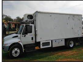
2009 DURASTAR REFRIGERATOR TRUCK RUNNER..... $16,000.