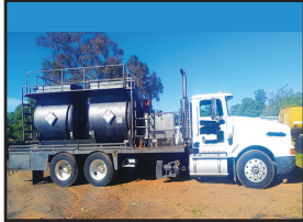
1991 INTERNATIONAL CHEMICAL CIRCULATOR ..... $15,000.