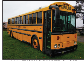
2007 THOMAS RUNNER C7 CAT .....$10,000.