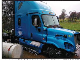
2011 CASCADIA W/ A DD15 ENGINE .....CALL