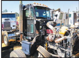
2009 PETE 386 ISX 450 BUILDER .....CALL