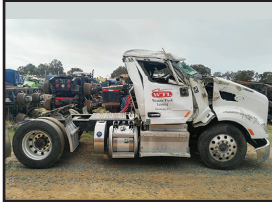
2015 PETE 579 W/ PACCAR, DEF AND FILTER. 80K MILES.....CALL