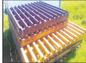
8' AND 12' AVAILABLE.....CALL