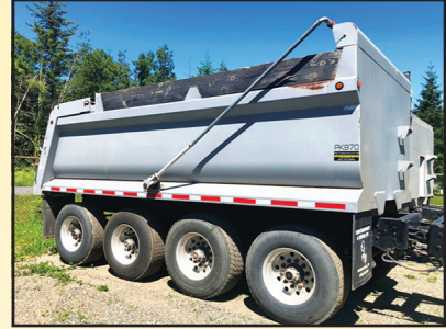
2007 STURDY WELD Pup Trailer.....CALL