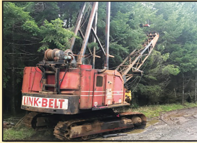
Link Belt LS 110 Yarder, Hyd. driven UC, Water Cooled Brakes, 4 Drums, CALL FOR DETAILS

LOOK AT OUR COMPLETE INVENTORY AT www.glenndickequipment.com