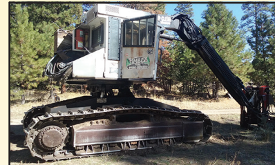
1995 Timbco 445B Feller Buncher super low hrs, plastic still on seat, bar saw..$50,000.