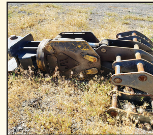
Jewell Brush Grapple, 5'1/4' brush jaws, set of log grapple jaws included...Call