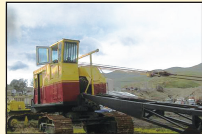
Bucyrus Erie 30B Highwalker Yarder, 6V92 Detroit, 0 hours rebuilt 6 speed Allison Transmission,.....$58,000.