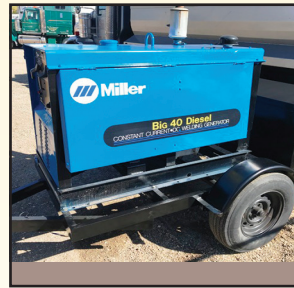
MILLER BIG BLUE 400D Portable Welder On Trailer $5,000.