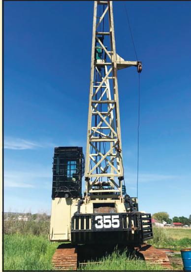
THUNDERBIRD 355 Yarder, 1 Season On The Following: Remanufactured Engine, Rebuilt Transmission, And Updated Lohman Final Drives. C/W Running/Standing Skyline Option Available Eagle Carriage And Rigging Truck (Please See Our Inventory Pictures GMC Rigging Truck)..CALL