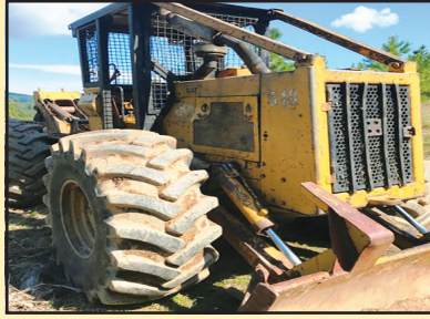
1986 CATERPILLAR 518 Skidder, Near New Tires, Sorting Grapple.....$26,000.