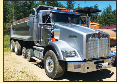
2007 KENWORTH T800 Truck With Williamson Dump Box .....CALL