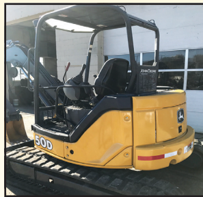
2007 JD 50D, 4600 hrs, 18" GP Bucket .....$30,000.