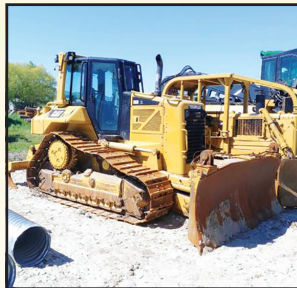
2011 CATERPILLAR D6N Dozer, Apprx 6,000 Hrs .....$120,000.0B0