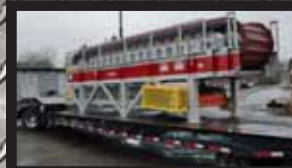
ACTECH Apron Feeder – Cat Rails, Manganese Pans, Built for your application. Price.....P.O.R.