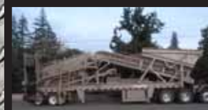
5x12 2 Deck Screener – Tandem Axle, CAT C4.4 T3 Engine, Hydraulic Drive Conveyors and Screen, 12 Yard Hopper with a Static Grizzly, Hydraulic Legs. PRICE.....$195,806.00