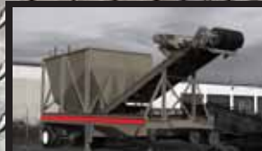
Load Out Bin – 40 yard capacity, 48" belt, Twin 30HP, Fluid Couplings. PRICE.....$75,433.00