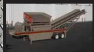
7X10 Screener – Tandem Axle, 60" under belt, Cat Engine, Set up to move quickly. PRICE.....$164,706.00