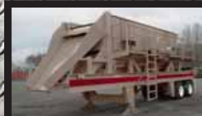
6X20 3 Deck Horizontal Screen – Tandem Axle Carrier, Rear Discharge Chutes. PRICE.....$143,806.00