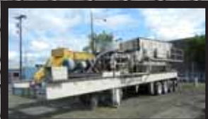
Cedarapids 54RCII with 6x20 3 Deck Screen, Open Circuit on Quad Axle Trailer, Currently being refurbished. Price.....$205,000.00