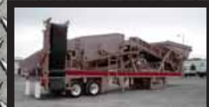
5x12 3 Deck Screener – Tandem Axle, CAT C4.4 T3 Engine, Hydraulic Drive Conveyors and Screen, 15 Yard Hopper with a Static Grizzly, Hydraulic Legs. PRICE.....$241,134.00