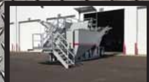
WOOD ROCK SEPARATOR – Portable Unit is great for dealing with waste, Works Best with an RDO Screener unit feeding the Separator. PRICE.....$235,294.00