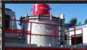
ACTECH V350 VSI – NEW Bare unit, 4" Feed 350 TPH Machine No Motor. Price.....$140,500.00