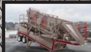
6x16 3 Deck Wash Plant – Twin 36" x25' Sand Screw, Tandem Axle Chassis, 5 spray bars per deck. PRICE.....$176,609.00