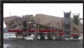
6x16 3 Deck Screener – Tri Axle, CAT C6.6 T3 Engine, Hydraulic Drive Conveyors and Screen, 15 Yard Hopper with a Static Grizzly, Hydraulic Legs. PRICE.....$288,885.00