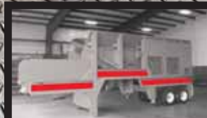
5220 RIP RAP PLANT – Onboard Cat C4.4 Tier 3, 52" x20' VGF, Two Adjustable Grizzly Sections, includes under conveyors. Price.....$262,736.00