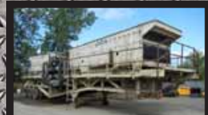
JCI Twin 7x20 3 Deck Screen – Blending conveyors, Tri Axle trailer. Price.....$199,500.00