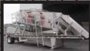
5x16 3 Deck Wash Plant – 36" x25' Sand Screw, Single Axle Chassis. Price.....$122,630.00